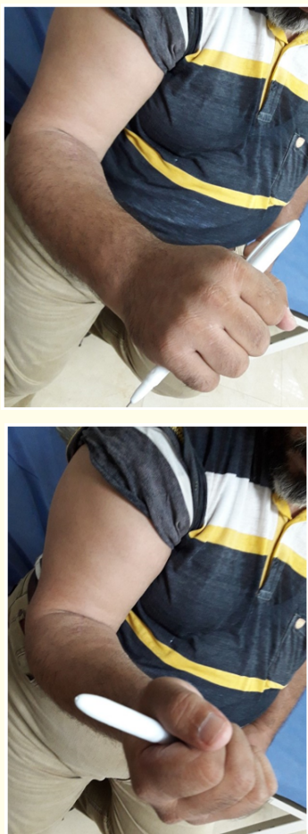
Figure 4: Active range of motion during follow up. A, Flexion. B, Extension. C, Pronation. D, Supination.