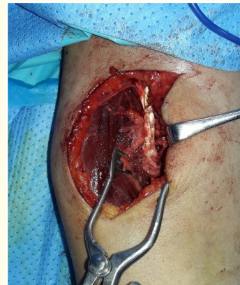
Figure 3: Intraoperative photo of the tendon after re-attachment.